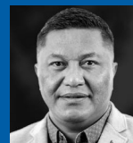
Kalani Kaneko Minister of Foreign Affairs and Senator, Majuro Atoll, Republic of the Marshall Islands