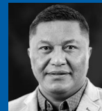
Kalani Kaneko Minister of Foreign Affairs and Senator, Majuro Atoll, Republic of the Marshall Islands