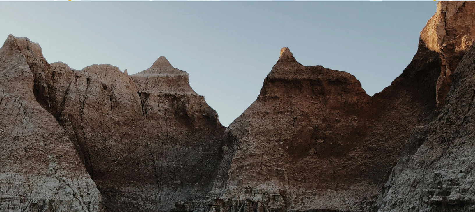
Interior, South Dakota