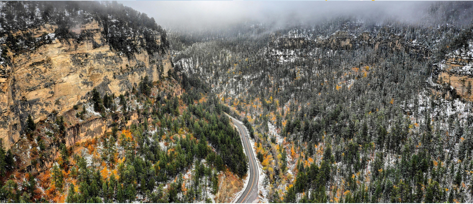
Spearfish, South Dakota