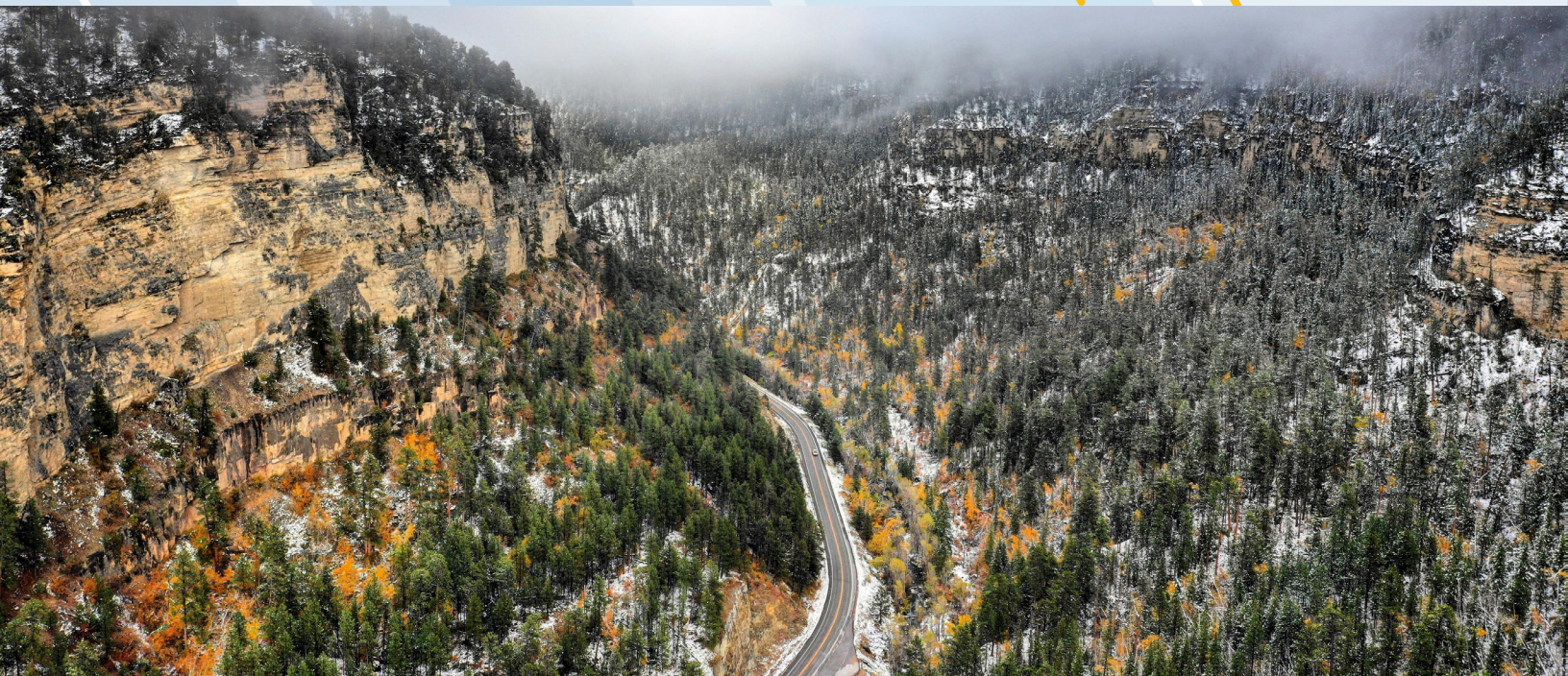
Spearfish, South Dakota