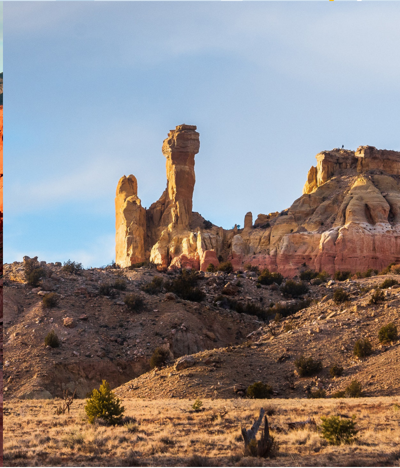
Abiquiu, New Mexico