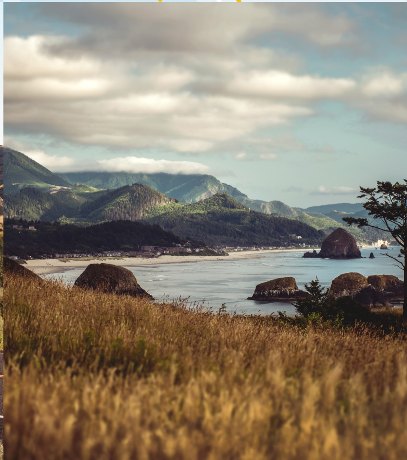
Cannon Beach, Oregon