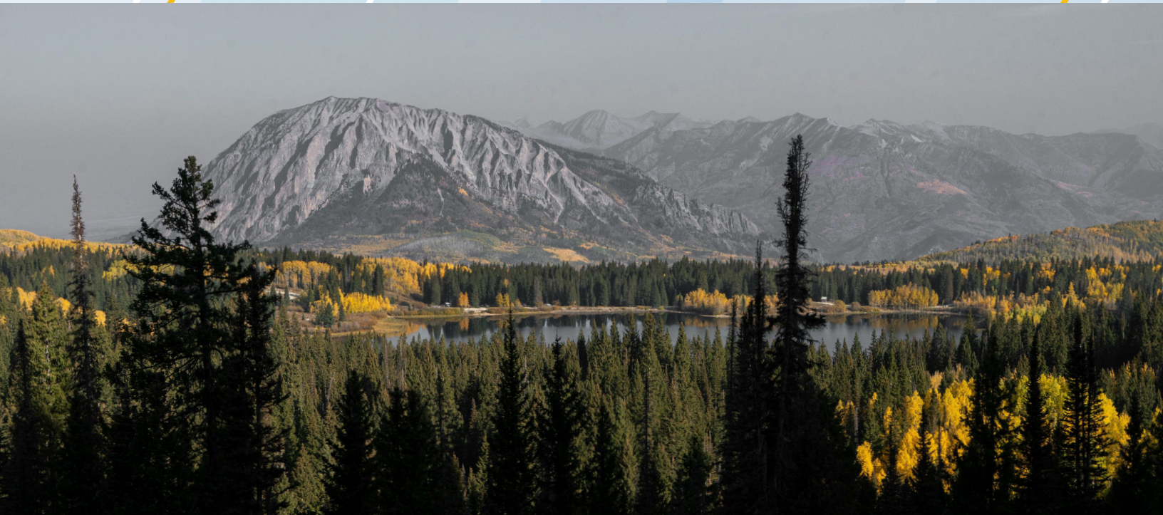
Crested Butte, Colorado