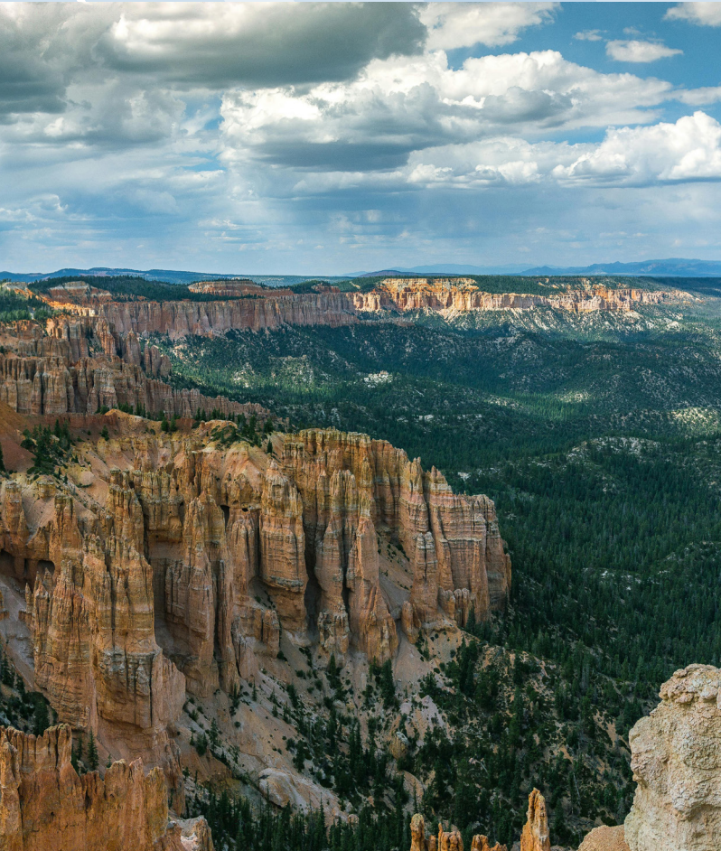
Canyonlands National Park, Utah