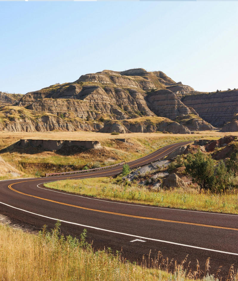
Watford City, North Dakota