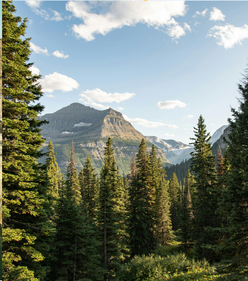
Glacier National Park, Montana