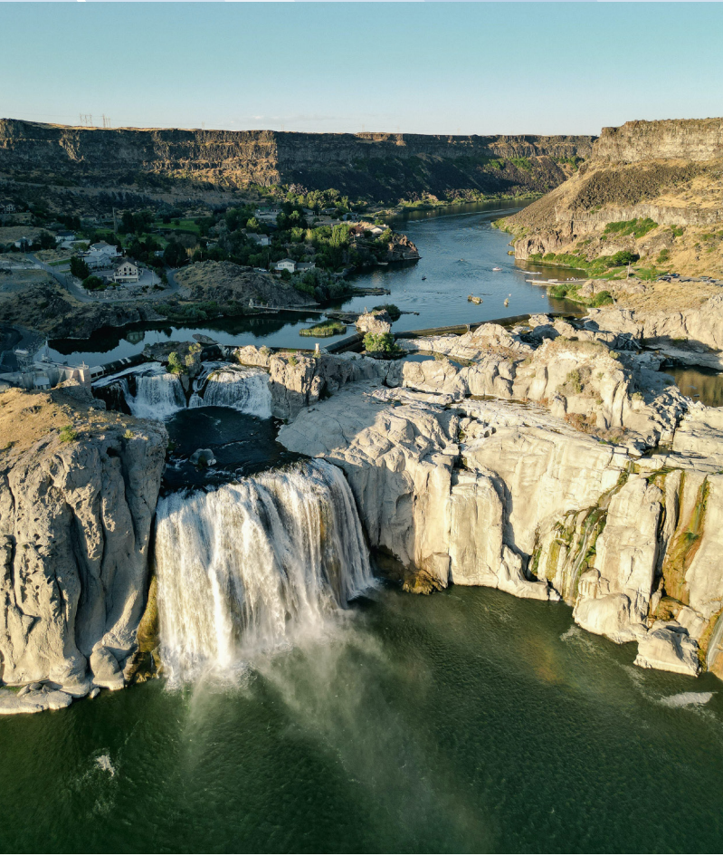
Shoshone Falls Park, Twin Falls, Idaho