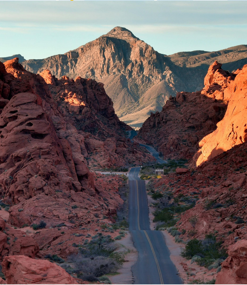
Red Rocks, Nevada