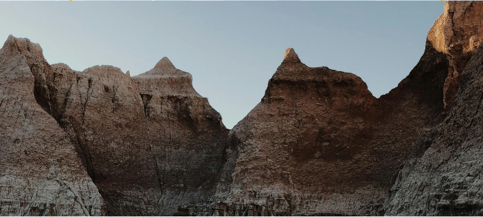
Interior, South Dakota