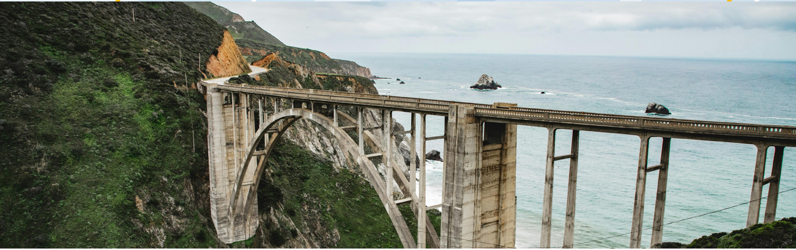
Bixby Creek Bridge, California