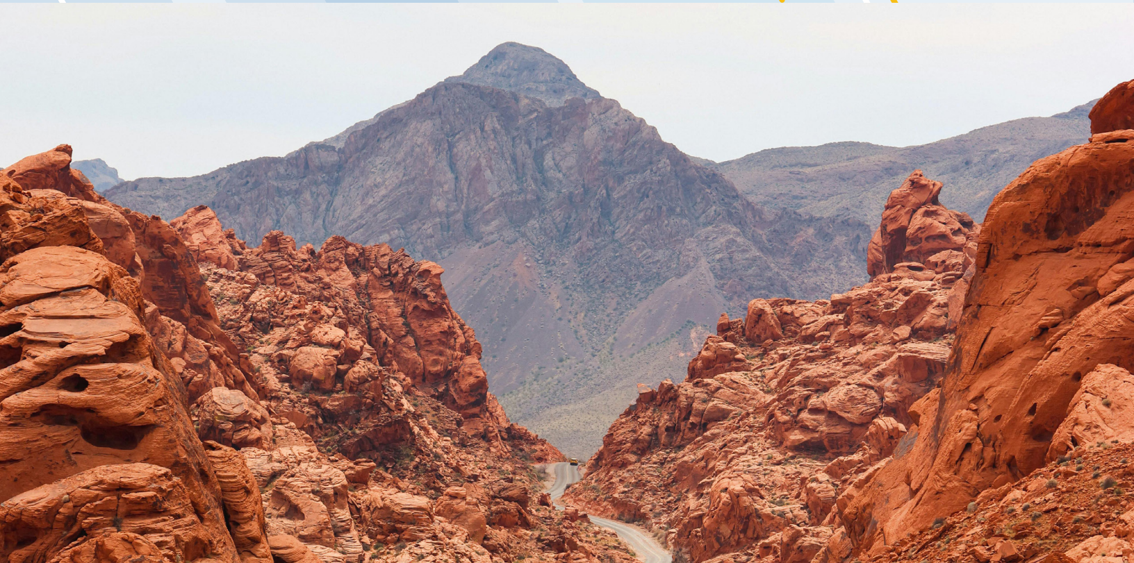
Moapa Valley, Nevada