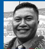
KALANI KANEKO Senator, Majuro Atoll, Republic of the Marshall Islands