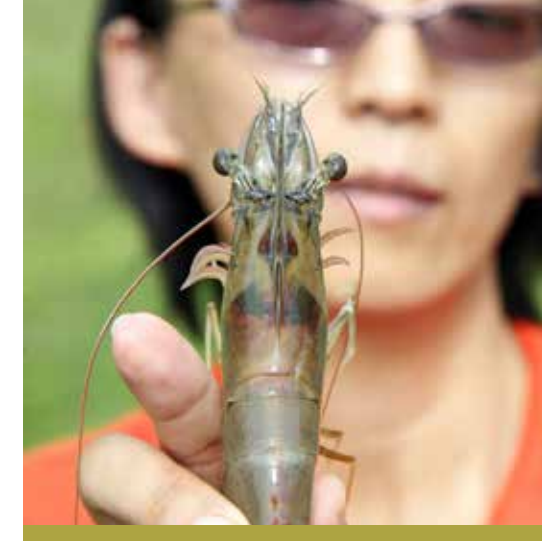
A public-private partnership is being explored for the UOG Hatchery.