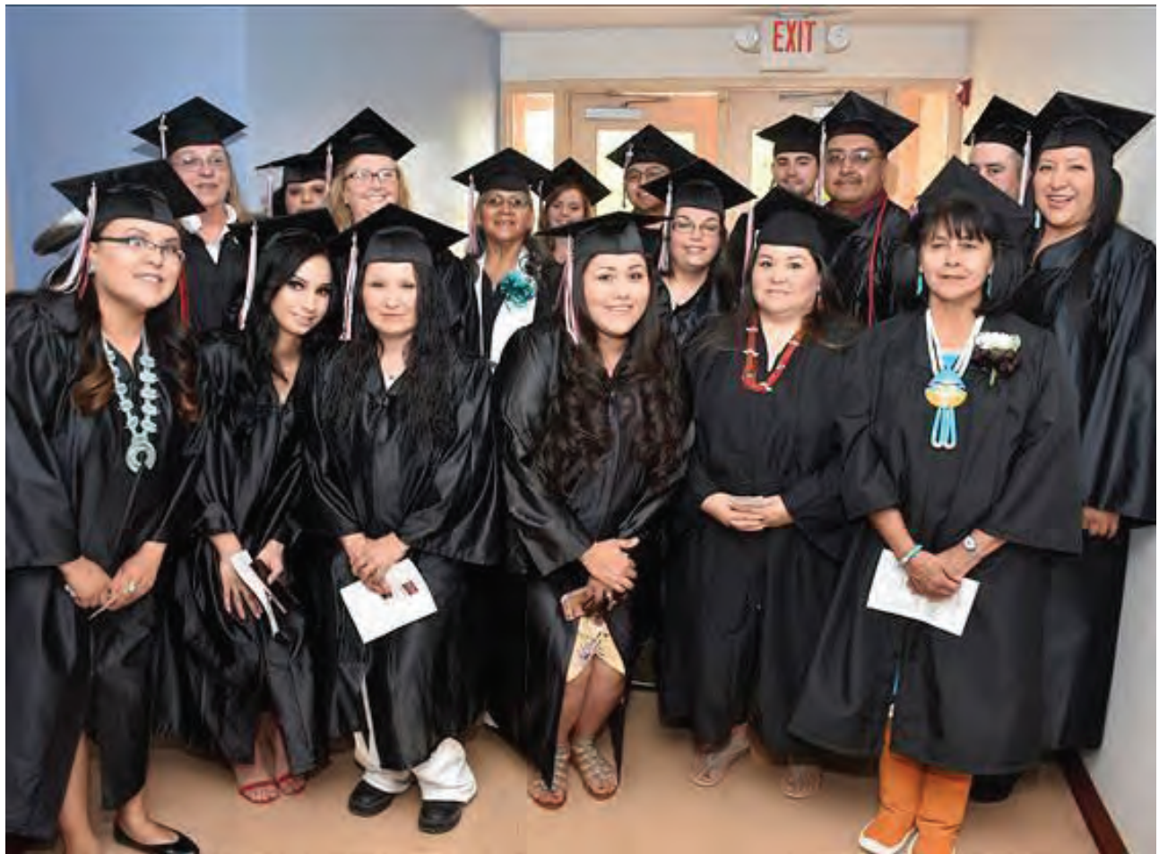
New Mexico State University - Grants

11:45 a.m. – 12:15 p.m. Open-mike on Potential Next Steps for the NASNTI Network Wrap-Up and Adjournment