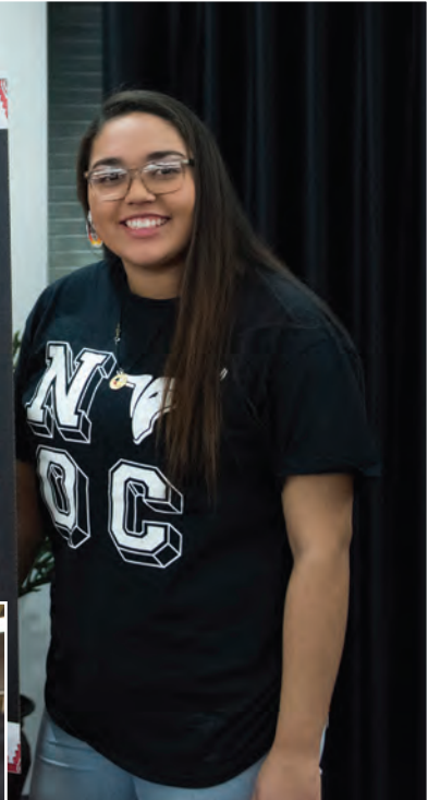
Northern Oklahoma College