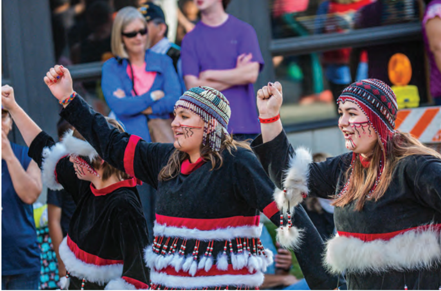
Kodiak College of the University of Alaska Anchorage