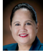
Tina Rose Muña-Barnes Senator, Guam Legislature