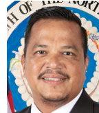
Jude Hofschneider Senator, Northern Marianas Commonwealth Legislature