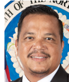
Jude Hofschneider Senator, Northern Marianas Commonwealth Legislature