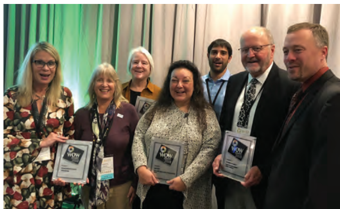
2019 WOW Award Winners