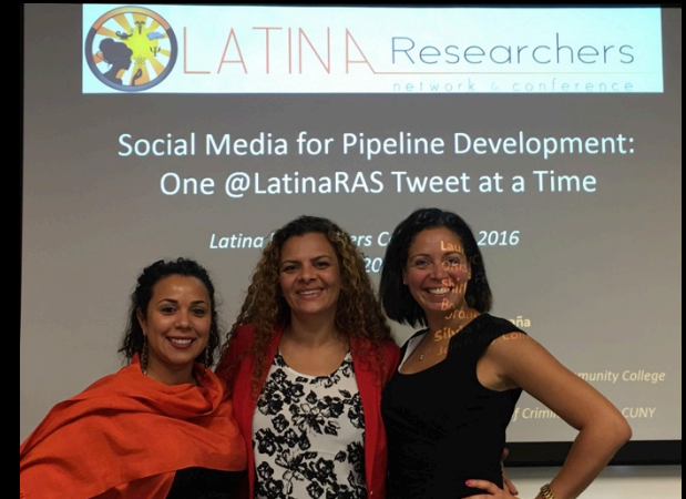
Discovery in every discipline