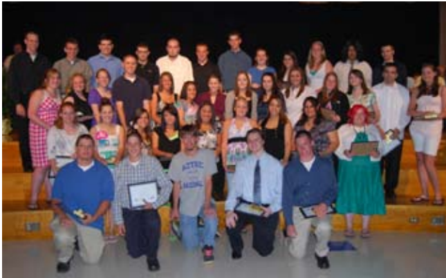
Massachusetts Scholars of Assabet Valley Regional Technical High School

Scholars, including painting the Scholars logo at the school entrance for every student to see and talking the program up in school publications. Assabet has held special programs for Scholars students to keep them motivated and on track. That support is especially important here: due to the school's tight schedule, Assabet students sometimes have to forgo other electives to meet SSI's language requirement; in addition, they must maintain a 3.0 GPA, like all Massachusetts Scholars.