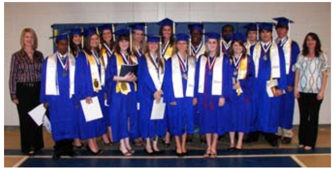
Mississippi Scholars of Sattillo High School

Since its inception in 2003, the Mississippi Scholars program has grown from two pilot school districts with two high schools and 24 graduates to 64 school districts with 100-plus high schools and 11,000-plus graduates. This May over 3,000 students met the challenge and graduated as