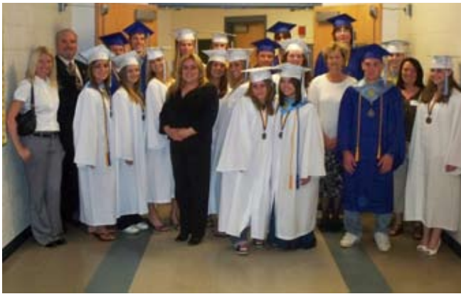
New Hampshire Scholars of Winnisquam Regional High School Scholars

A new advisory board of business, higher education, policymakers, and K-12 leaders has been created to support the work of New Hampshire Scholars, a collaborative project of the New Hampshire College & University Council, community partners, and the New Hampshire Department of Education. Members of the advisory board will endorse the initiative as an important aspect of a student's academic development. In an effort to achieve statewide sustainability, members