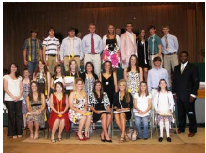
Mississippi Scholars of Moorville High School

Several districts have had particularly strong success this year. Brookhaven-Lincoln County, which launched its program in 2006 with just 26 students and $8,000 in scholarships, honored 202 seniors as Mississippi Scholars at a gala banquet hosted by Easthaven Baptist Church in April. Sixty students were awarded a total of $92,500 in scholarships, funded by colleges, universities, local businesses, and individuals. Every student was individually recognized on stage and presented with a medallion and certificate as their picture