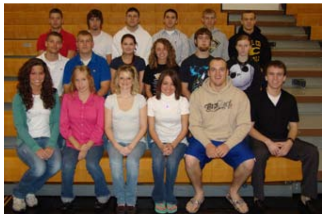
Kentucky Scholars of Carroll County

Columbia Gas of Kentucky has contributed $20,000 to establish an Achievement Award fund. The fund,