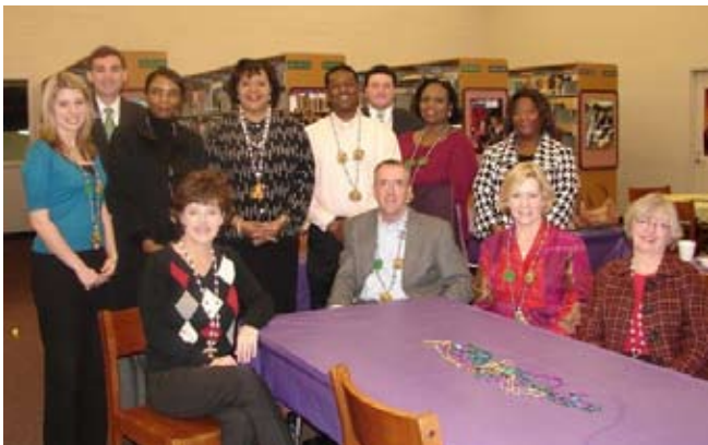
Business Presenters for Pass Christian School District

For the fourth year in a row, Lee County high schools – Saultillo, Mooreville, and Shannon – participated in the program, with a combined total of 70 seniors graduating as Scholars. Students received gift cards in recognition of their outstanding efforts. And earlier this year a new high school – Pass Christian – located in the Pass Christian School District, which was devastated by Hurricane Katrina four years ago – joined the Scholars program, sending members of the business community to talk to students about the importance of taking challenging courses.