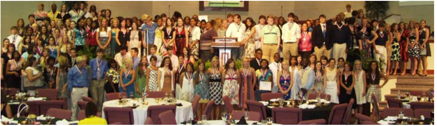
Mississippi Scholars of Brookhaven Lincoln County

was shown on video screens. Almost 500 people attended the banquet, making it the largest ever held in Lincoln County.