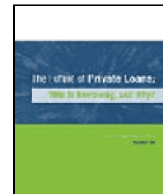
The Future of Private Loans: Who Is Borrowing and Why? December 2006