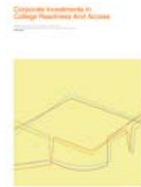
Corporate Investments in College Readiness & Access June 2008