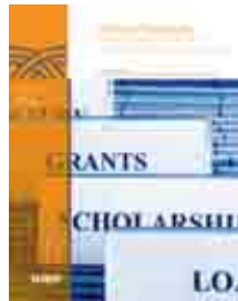
Window of Opportunity: Targeting Federal Grant Aid to Students with the Lowest Incomes April 2008

IHEP has made important contributions to federal policymaking, particularly in the area of college readiness and student aid.