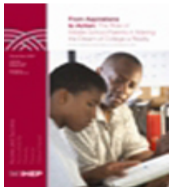
From Aspiration to Action: The Role of Middle School Parents in Making the Dream of College a Reality December 2007