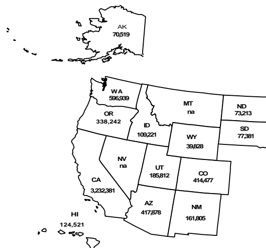
Figure 2 Adult High School Graduates Diagnosed with a Mental Disorder