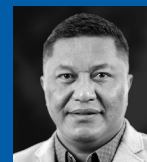
Kalani Kaneko Senator, Republic of the Marshall Islands